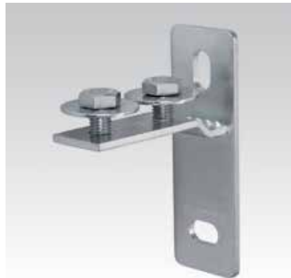
MPC-Channel support bracket, crosswise