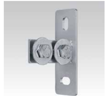
MPC-Channel support bracket, lengthwise