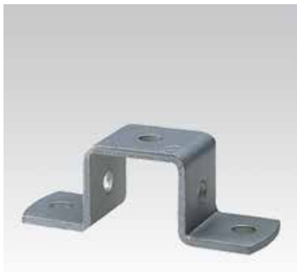
For profiles 28/30 and 38/40