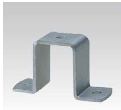
For profiles 40/60, 40/80, 38/80 and 40/120